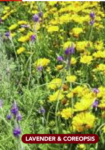
LAVENDER & COREOPSIS

All trees and plants will burn if ignited. Some are potentially more volatile because they contain waxes, fats, terpenes, or oils. Fire-prone species have gummy, resinous sap and a strong odor. In fact, much of the native vegetation found in San Diego County is highly flammable.