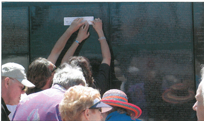
Volunteers handed out paper for visitors to etch the name of a friend or family member on the wall.

Preamble of the Vietnam Veterans Memorial