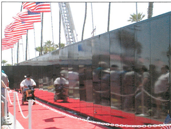
Vietnam Veteran looking at the names on the Wall.